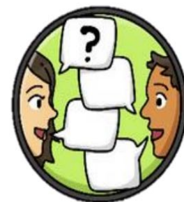
Inquiry through Dialogue